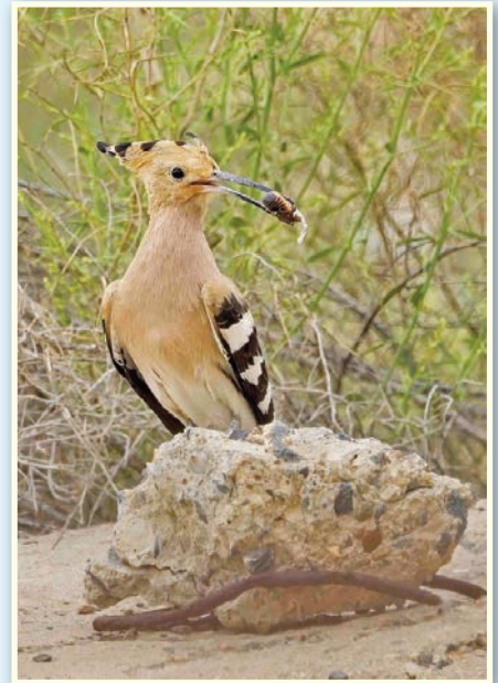
Eurasian Hoopoe, Uzbekistan