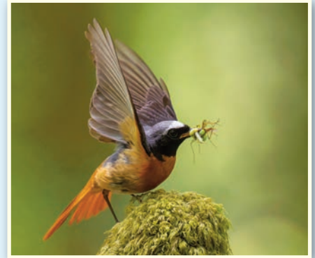
Black Redstart.