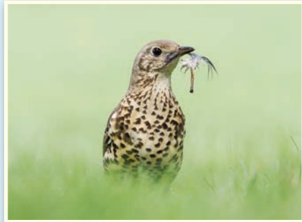
Mistle Thrush.

Please note: This is the last meeting of the season before we return on Tuesday, 8 September in St Paul's Parish Room .