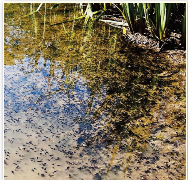
Tadpoles in Apostle's Pond April 2026.