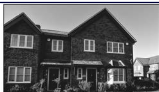
CHIPPERFIELD OIEO: £800,000

Proffitt and Holt are delighted to offer to the market this rarely available four-bedroom semi-detached family home located in a modern and very quiet close in the highly sought after village of Chipperfield. EPC - EER: B / Council Tax Band: F