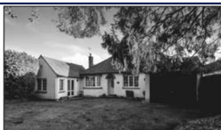
CHIPPERFIELD ASKING PRICE: £850,000

NO UPPER CHAIN. IN NEED OF MODERNISATION A characterful 2/3 bedroom detached bungalow in need of modernisation throughout and situated in one of Chipperfield's most sought after roads. The property sits on a large plot with the rear garden measuring approx 150ft and offers spacious accommodation as well potential for further extension if required (STPP). EER: F / Council Tax Band: F