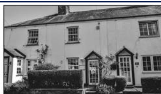
CHIPPERFIELD GUIDE PRICE: £650,000

NO UPPER CHAIN. An individual Victorian cottage in the heart of Chipperfield. With South-facing garden, OFF STREET PARKING FOR 2 CARS, garage and studio space offering huge potential for anyone running a business from home subject to relevant permissions. PLANNING PERMISSION GRANTED FOR FIRST FLOOR EXTENSION. EER: D