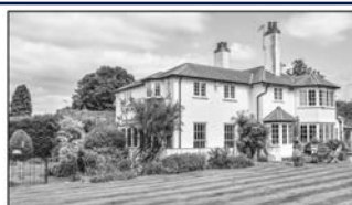
CHIPPERFIELD GUIDE PRICE: £2,500,000

Proffitt and Holt have the pleasure of marketing this rarely available Georgian detached home, in a picturesque setting in the heart of Chipperfield. Offering complete seclusion, this beautiful property has the perfect blend of traditional character features and modern living accommodation. It also sits on grounds of just short of an acre. EER: D