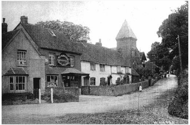
The Street circa 1910