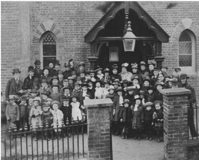
Chipperfield Sunday School circa 1895

In the photograph of Chipperfield Sunday School taken outside the front of the church, you can