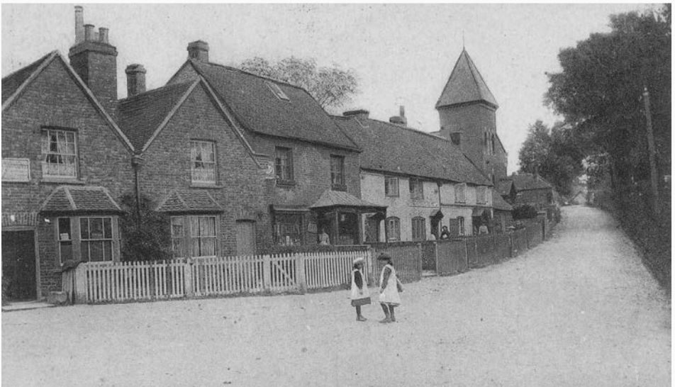
The Street circa 1906

Attendance on Sunday mornings was around 200! Most of the congregation would have walked considerable distances.