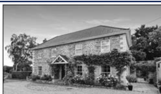
CHIPPERFIELD OIEO: £2,000,000

Proffitt and Holt are proud to offer to the market this stunning and rarely available 5 bedroom, 4 reception room, 3 bathroom 'Georgian Style' detached family residence located in a quiet and idyllic location within Chipperfield on approximately half an acre plot and surrounded by far reaching countryside views. EPC - EER: B